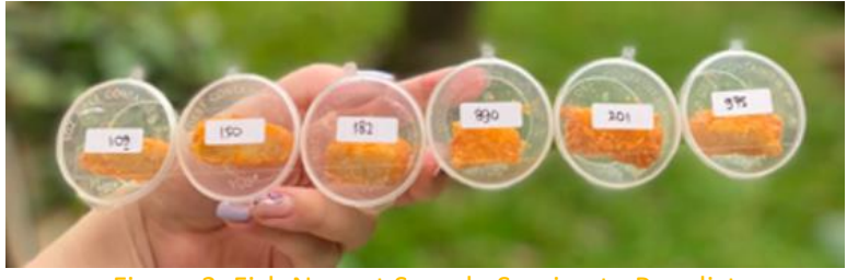
Figure 3. Fish Nugget Sample Serving to Panelist.

In this research, 100 untrained panelists carried out the acceptance test. The number of samples presented was six samples with different combinations for each panelist. First, each sample of the fish nugget was deep-fried at 180°C for 2 minutes and cooled. Then the samples were presented separately in equal volumes, each in an airtight plastic container labeled with a random three-digit code (Figure 3).