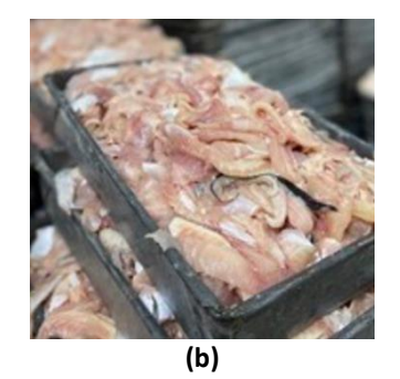
Figure 1. (a) Pangasius Fish Fillet; (b) Pangasius Trimmings.